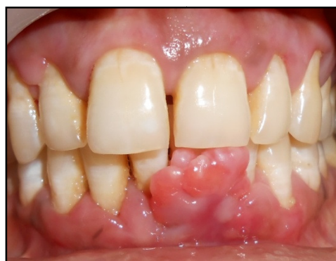
(Fig 4): At Baseline

42 years of female reported to the department of periodontology with overgrowth in the lower front teeth region since 7 months. Intraoral examination revealed irregular, pinkish red gingival growth in mandibular central incisor area measuring 1x1.5 cm. (Fig 4, 5)