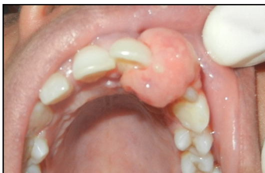
(Fig 6) At Baseline

arising from interdental papilla between maxillary left central incisor and lateral incisor. It was approximately 2×2.5 cm in size. Lesion was pinkish red, smooth surfaced and firm in consistency. (Fig 6, 7)