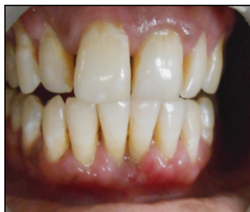
(Fig 5) 6 months follow up