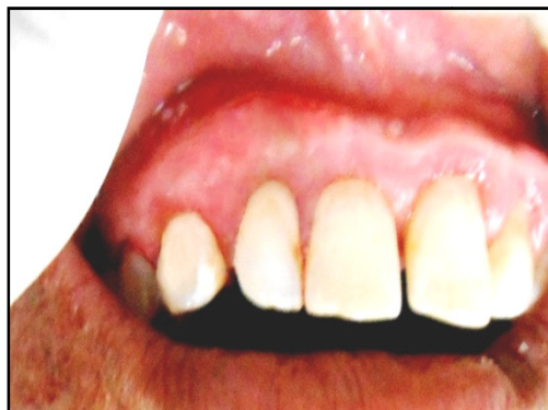
(Fig 2): 6 months follow up