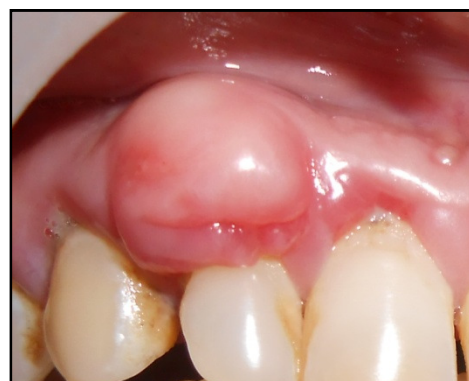
(Fig 1): At Baseline

inflammation and calculus deposits were seen in patients mouth. (Fig 1)