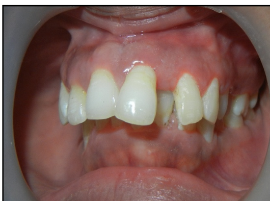
(Fig 7) 6 months follow up

Similar treatments were carried out in case 2 and case 3 as performed in case 1. Both cases were evaluated upto 6 months. No recurrence was found. Histopathology of exisional biopsy of both cases showed increase in fibrous area along with bony trabeculae.