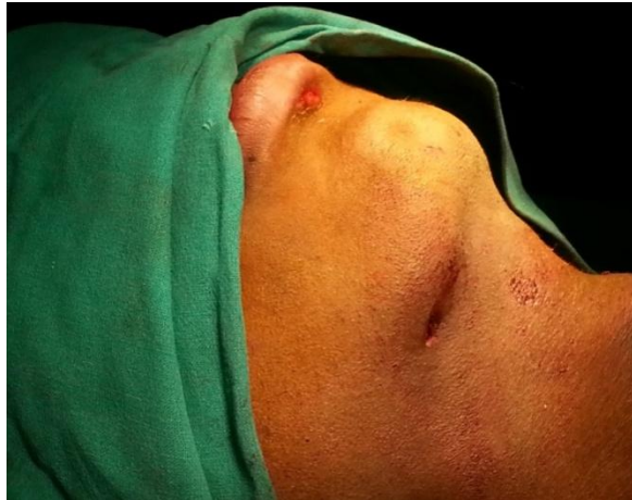
Fig (1) shows the extra oral percutaneous

approach used for the insertion of lag screw.